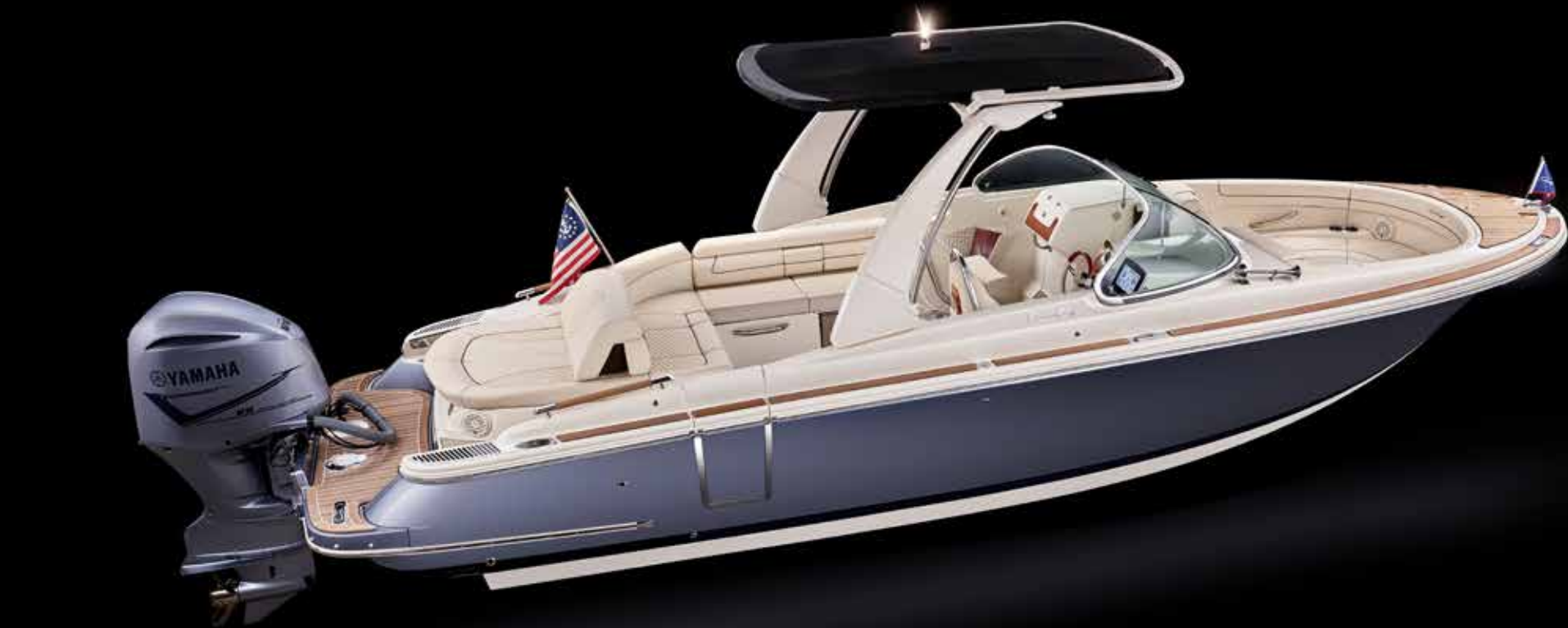
*Shown with folding arch top. Fixed painted hardtop shown on page 31.