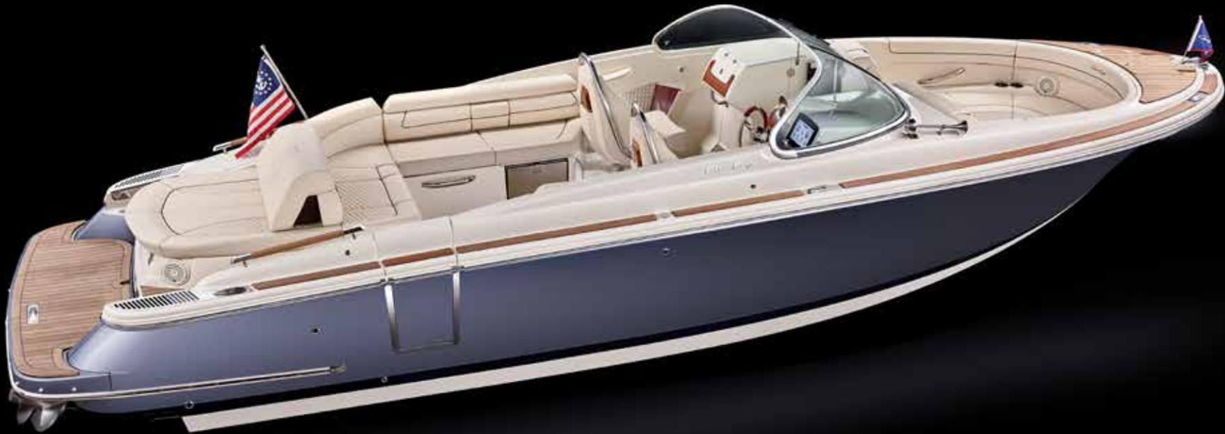
LAUNCH 28 GT